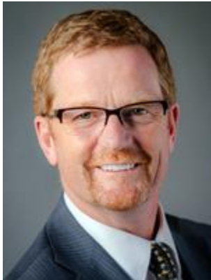
Honourable Terry Lake Minister of Health

Electronic health record systems ultimately will support patients in being active partners in their care – as well as assisting our health professionals in the provision of high